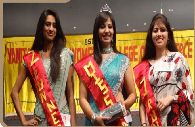
Miss Vanita Contest