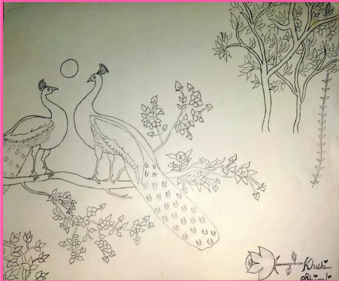
By - Khushi Shrimali