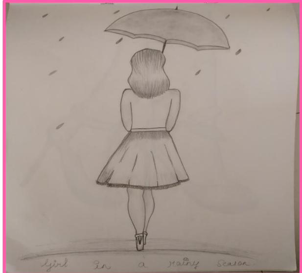
By - Payal Sirvi