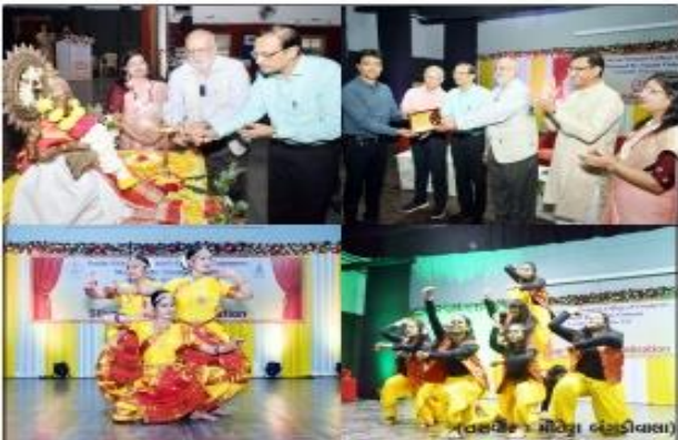
सहैरणी गृहणीती संस्था वनिता विश्राम संस्थावित वनिता विश्राम विमेन्स कोलेज ओफ़ कोमर्सना २५ वर्ष पूर्ण शता कोलेज द्वारा 'रजत जयंती महोत्सव' नुं आयोजन करवुं छतुं.