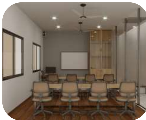
CAD (INTERIOR DESIGN)