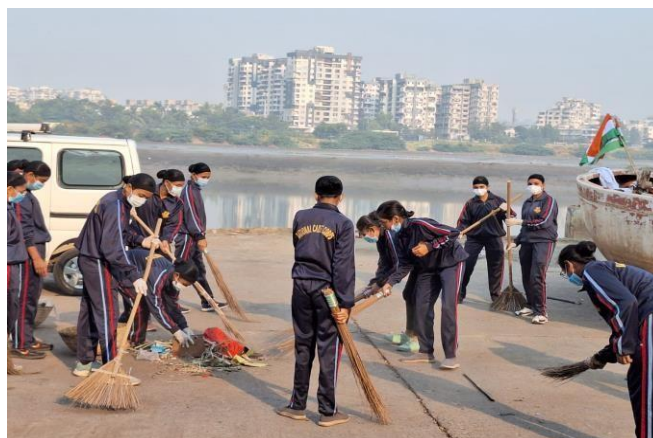
Swachhata Abhiyan at Nanpura Riverfront on the occasion of NCC Day on 25 th November, 2023.