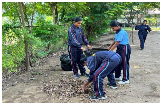
Swachhata Hi Seva- Campus Cleanliness Drive on 2nd October, 2023.