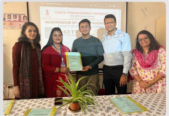
BOKETTO- Restro and Cafe