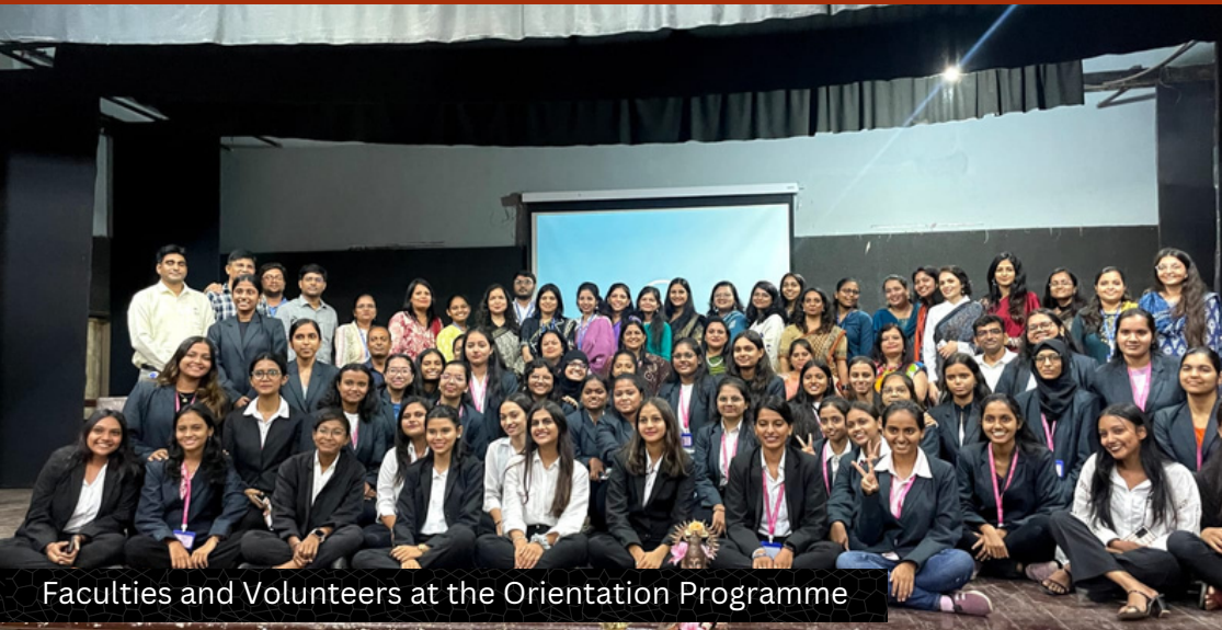
Faculties and Volunteers at the Orientation Programme

JUN-AUG (2023-24) | VOLUME: III, ISSUE: I