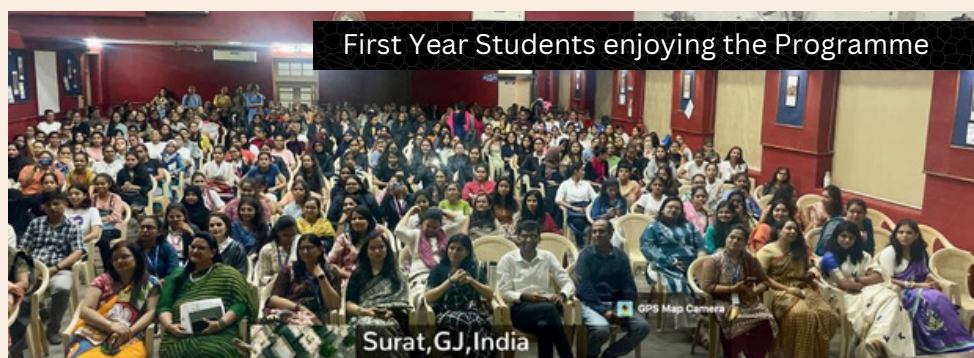
First Year Students enjoying the Programme