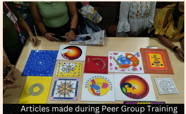
Articles made during Peer Group Training

The peer group training was organised from 18th July to 24th July 2023 with an objective to foster an environment of mutual respect and provide an opportunity to everyone to contribute equally towards the learning process. Postgraduate students conducted the training for first year students on different topics such as Tie and Dye, Coffee Painting, Illustration, Mandala Art, the Basics of Draping, and Beadwork. The training provided a platform to the students to share their thoughts and discuss new ideas.