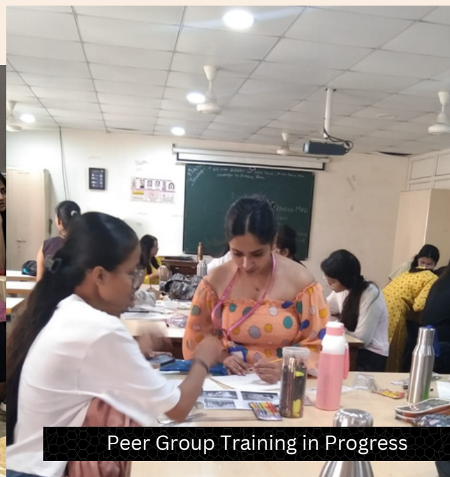
Peer Group Training in Progress