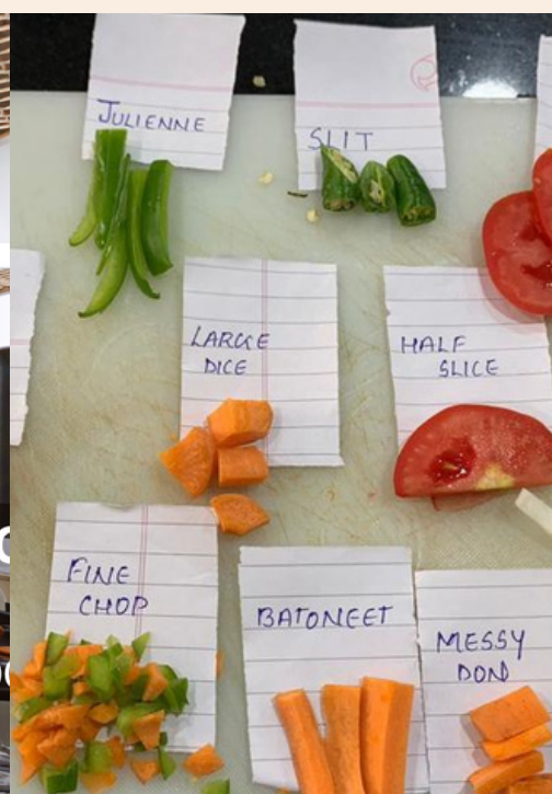
Training in Food Production Skills