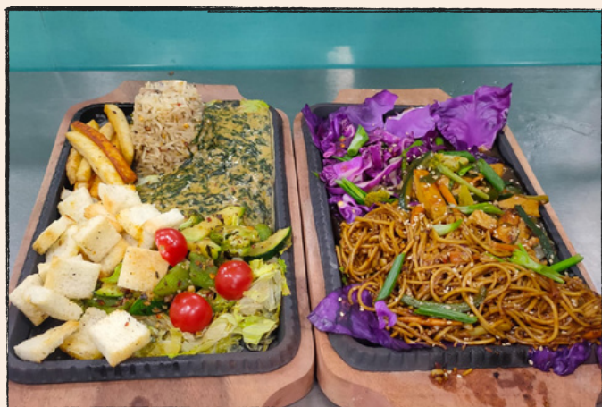
Final Plating of the Sizzlers

Two popular varieties of sizzlers were prepared by the Chef, the French Sizzler, and the Oriental sizzler.