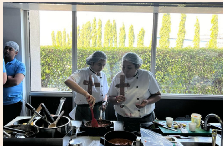
Participants during the Competition