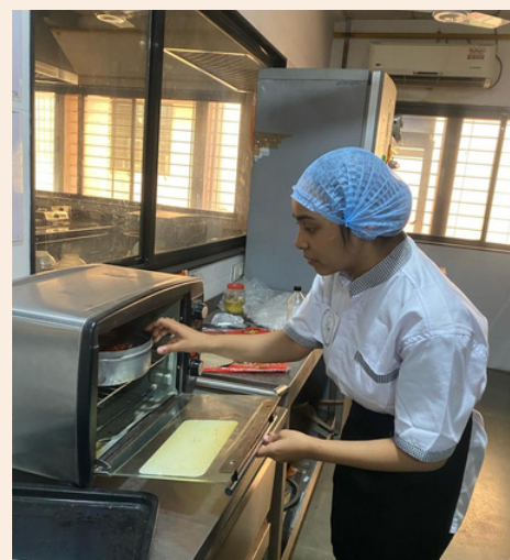
Students at Work in the Kitchen