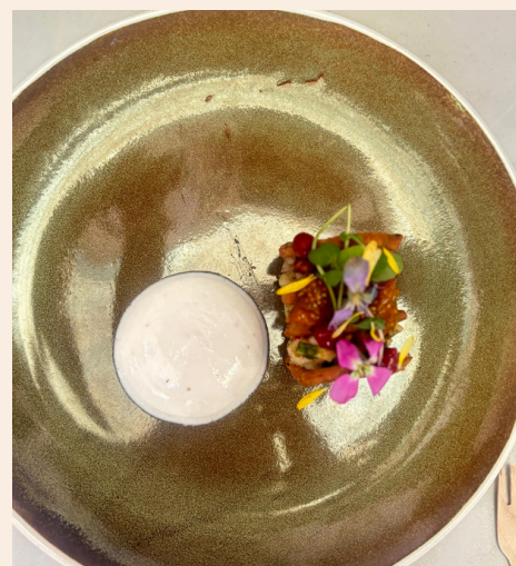
The Beautiful Display of Students Culinary Work