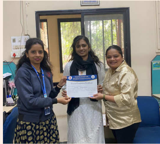
Certificate Distribution of Short Term Course in Bakery was done on 6th January 2024