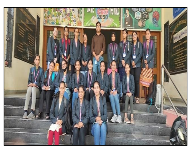
Visit to Ashpee Shakilam