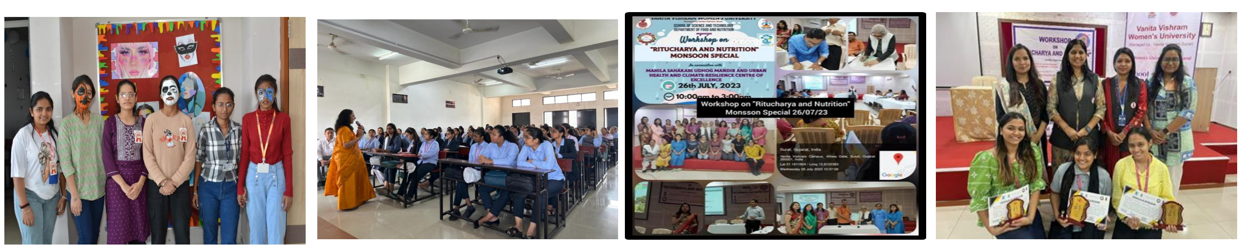
Workshop on Cyber Security

An Expert Talk on Research and Career Guidance in Academia