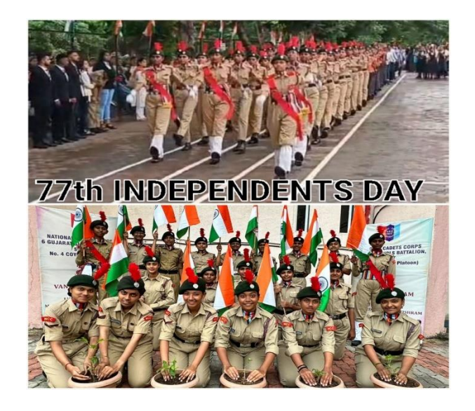
77th Independence Day Celebration at Bajigauri open air Theatre