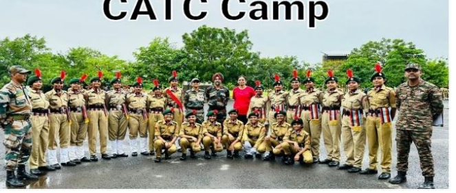
Combined Annual Training Camp at Jeetnagar, Rajpipla