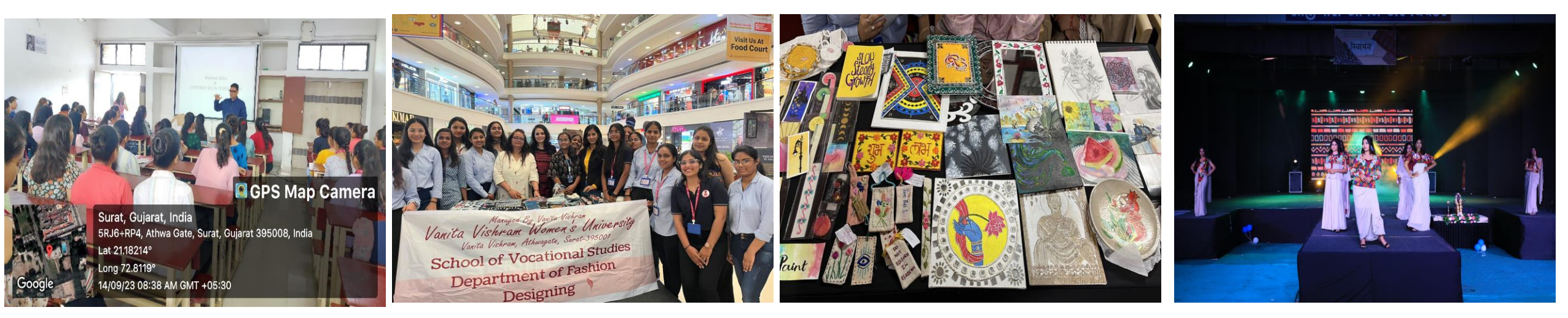
Expert Talk on Entrepreneurship and Employability

Academic Guest Lecture on Business Ethics and Corporate Social Responsibility