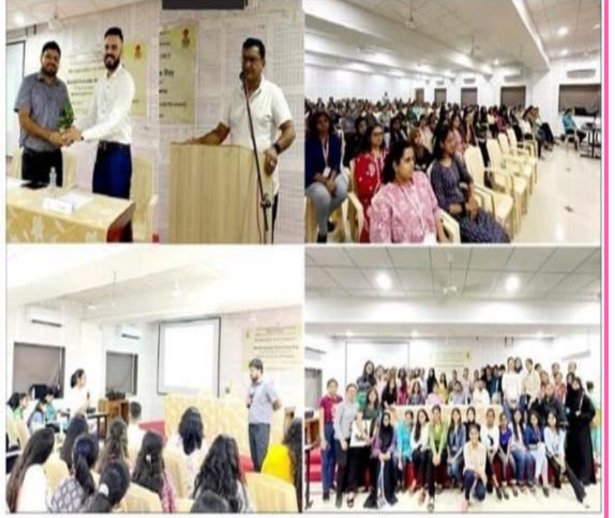
વિશ્વ આત્મહત્યા નિવારણ દિવસ નિમિત્તે વનિતા વિશ્રામ મહિલા યુનિવર્સિટીના મનોવિજ્ઞાન વિભાગ દ્વારા સેમિનાર યોજાયો હતો.